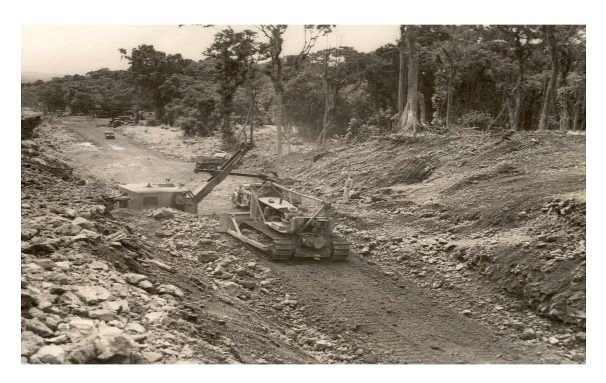
19<sup>th</sup> MCB on Cape Gloucester, Dec. 1943 with General Sherman tanks firing armor-piercing 75mm shells to a depth of ten feet superseded pneumatic drilling and dynamite crews in the opening of lava pits.