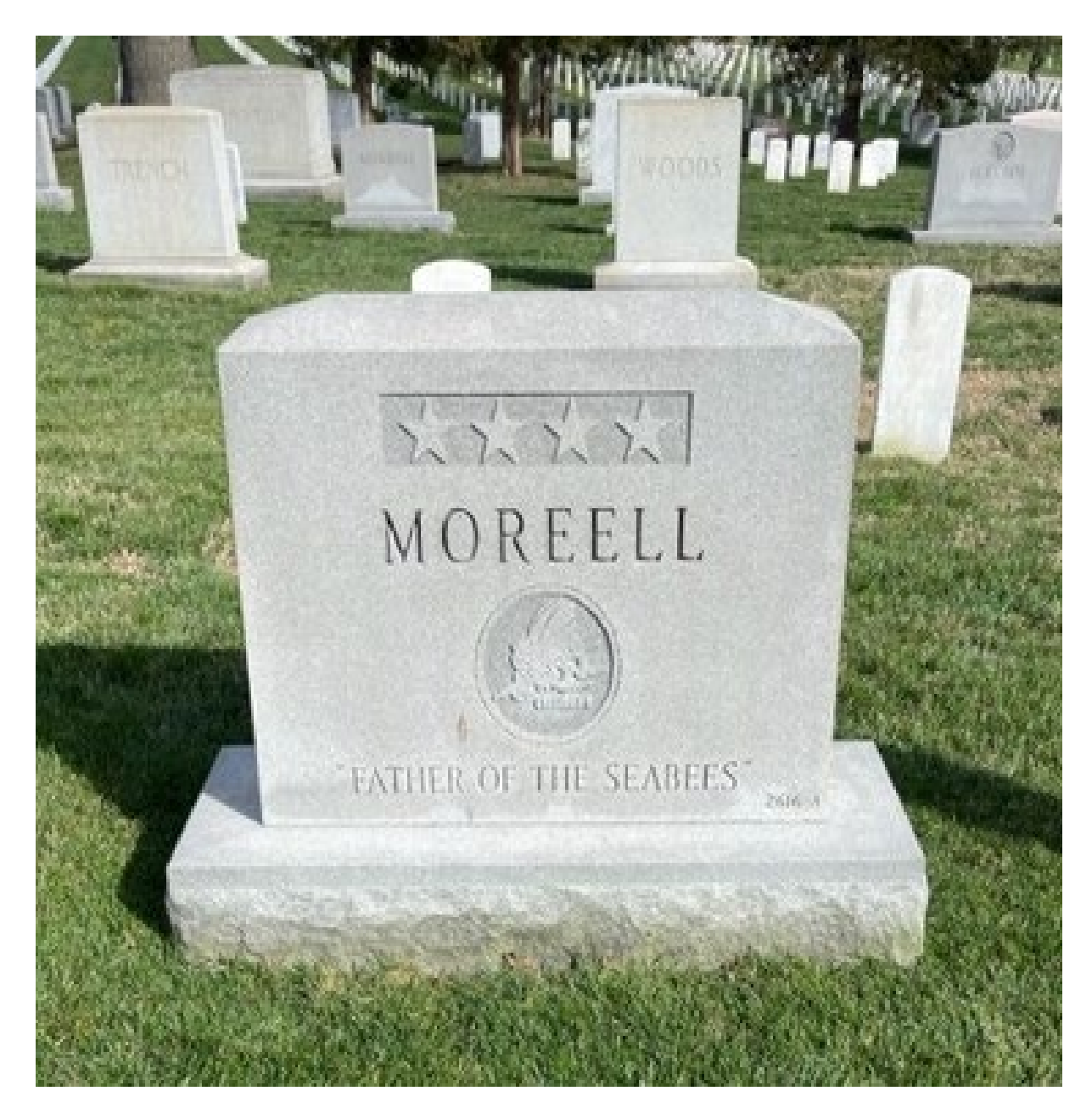
Volume 33, Edition 1, Spring 2023