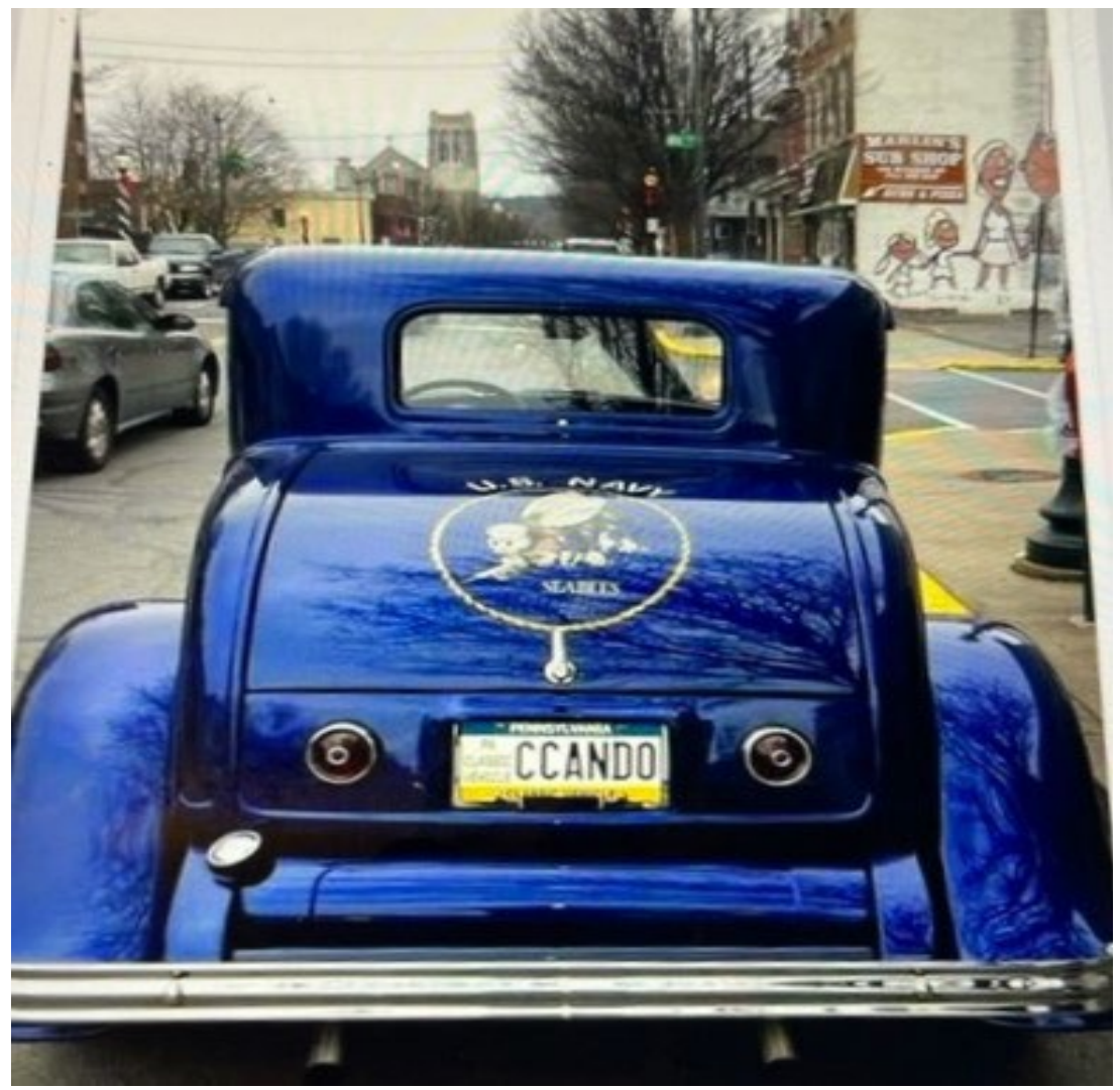
Somewhere around Philly!

Below is the plaque that is to be installed on a bench in the Military Veterans area at the New York State Fair Grounds in Syracuse, NY. Island X-19 is working to have the dedication ceremony around May 28<sup>th</sup>, 2023.